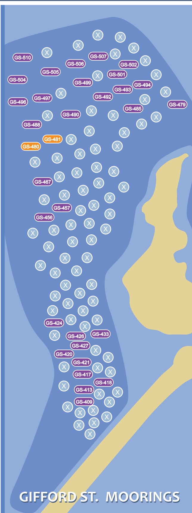
GIFFORD ST. MOORINGS