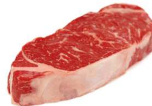
Bovine Meat $169