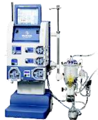
3. Machinery 36.9 USD Billions