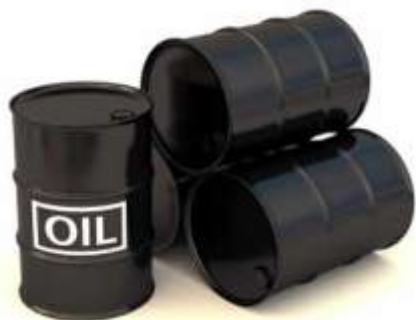
4. Oil and fuels 34.6 USD Billions