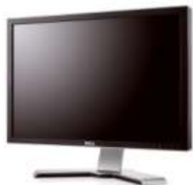
1. Electronics 59.5 USD Billions