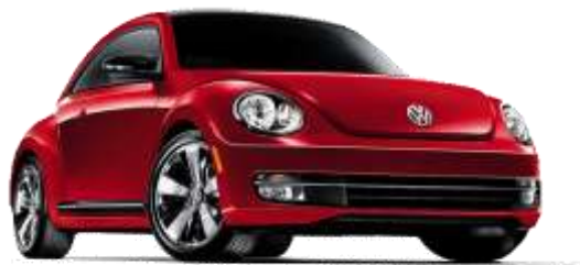
2. Vehicles 41.0 USD Billions