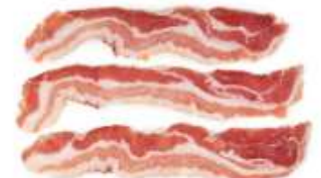
Swine Meat $243