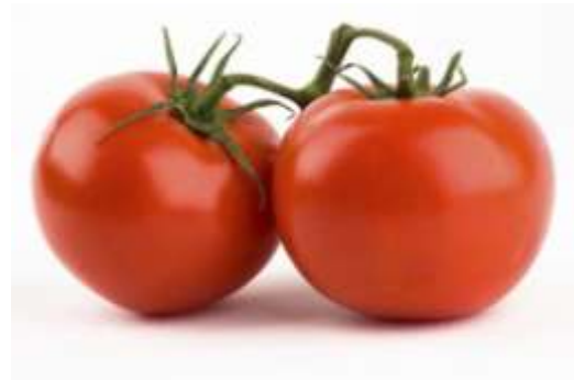
5. Food and Beverage 18.0 USD Billions